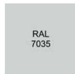
Ral 7035 Light Grey