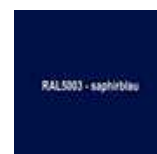
RAL 5003 Sapphire Blue