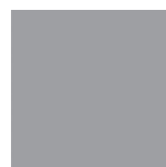
Ral 7004 Signal Grey