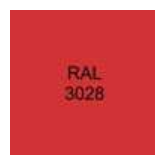
RAL 3028 Pure Red